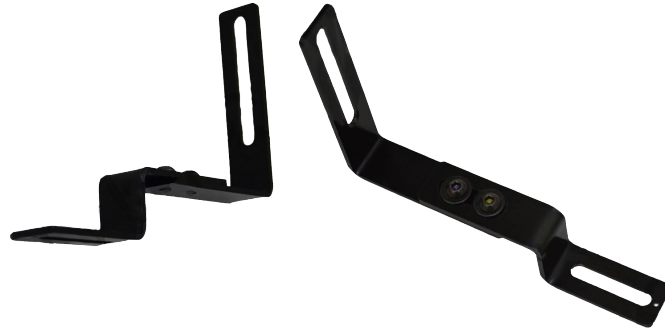
A) OFFSET MOUNT