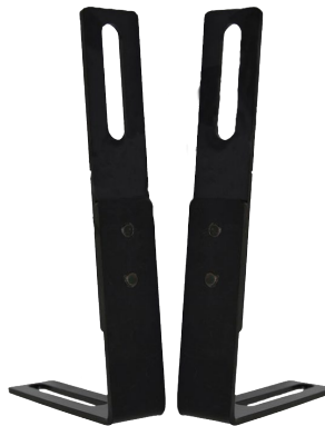
B) FLUSH MOUNT